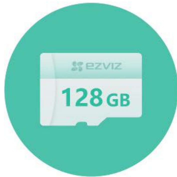
Supports MicroSD Card

The LC1 comes with a built-in MicroSD card slot that can store up to 128 GB of recorded footage. You can also save your images to EZVIZ Cloud or EZVIZ NVRs for additional back-up. (Cloud storage service is only available in certain markets. Please verify the availability before making any purchase.)